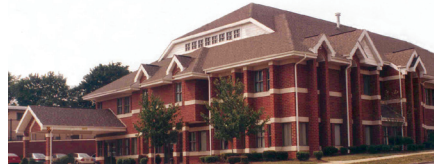
Summit County ADM Crisis Center 15 Frederick Avenue • Akron

Inpatient and Outpatient Detoxification - The Detoxification Unit at the Summit County Alcohol, Drug Addiction, and Mental Health (ADM) Services Crisis Center provides medically supervised, inpatient and outpatient services for adult, Summit County residents who are intoxicated or experiencing withdrawal symptoms. The detoxification process consists of three essential components: evaluation, stabilization, and preparation for entry into substance abuse